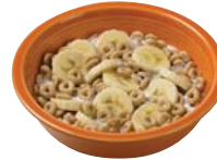
1 small banana