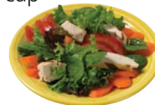
1 cup of lettuce* and ½ cup of other vegetables