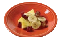
½ cup of fresh mixed fruit

In addition to fruits and vegetables, a healthy diet also includes whole grains, fat-free or low-fat milk products, lean meats, fish, beans, eggs, and nuts, and is low in saturated fats, trans fats, cholesterol, salt, and added sugars.