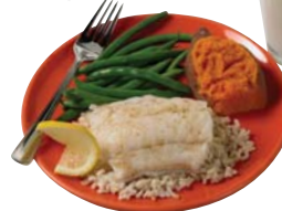
½ large sweet potato and ½ cup of green beans